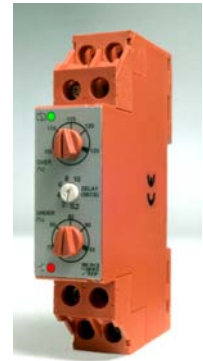
Terminal Protection to IP20