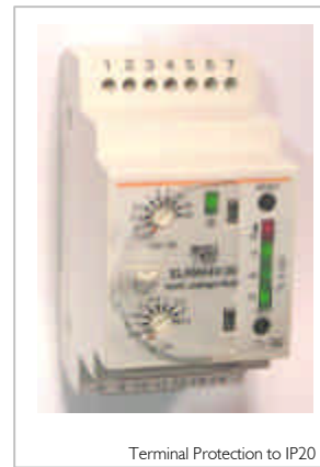
Dims: to DIN 43880 W. 44mm